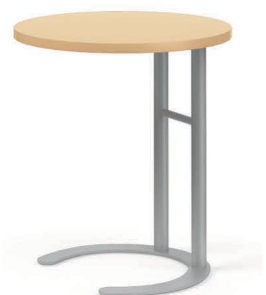
ADULT LOUNGE & PERSONAL TABLE