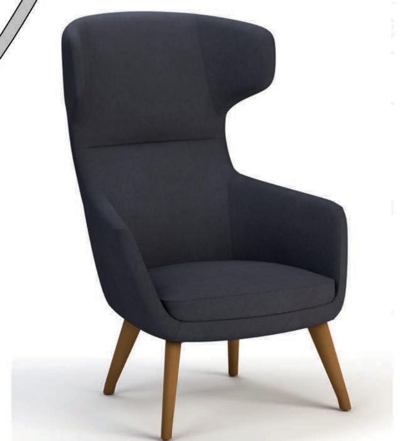
ADULT HIGHBACK LOUNGE